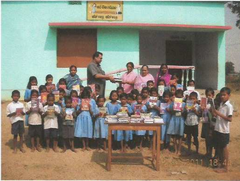
Teachers of Baghamarasahi Primary School, Baghamara, Talcher receiving Library Books from M/s Global Coal & Mining Pvt. Ltd., Talcher