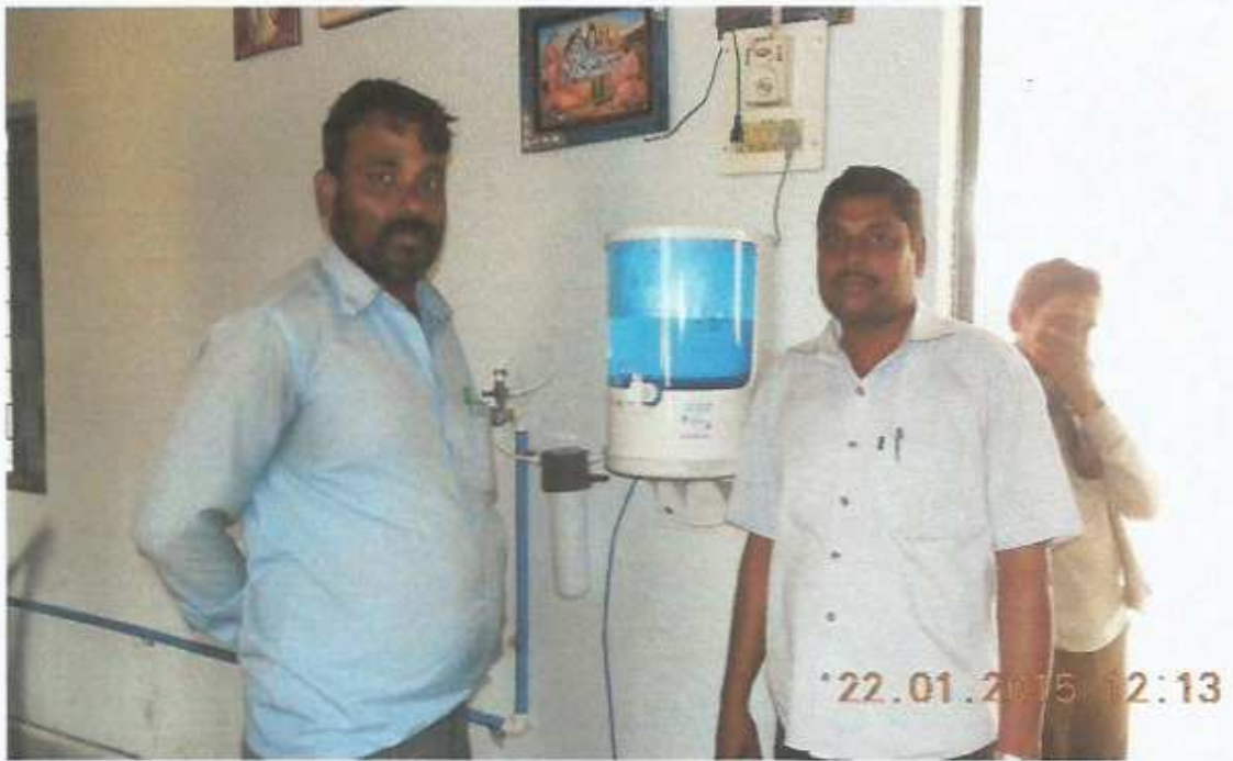
Aquaguard fitted in the school of Vivekananda Sikshya Kendra, Ghantapada, Talcher by Global Coal & Mining Pvt. Ltd.