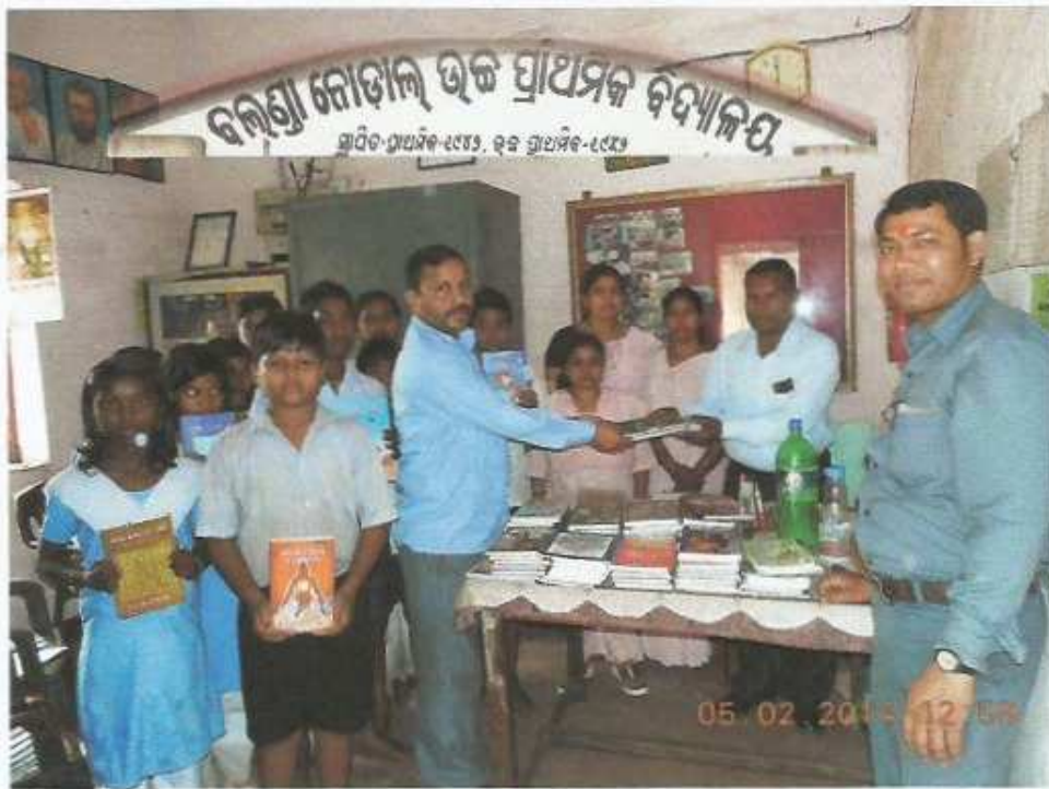
Head Master, Balanda Nodal U.P. School, Talcher receiving Library Books from M/s Global Coal & Mining Pvt. Ltd., Talcher