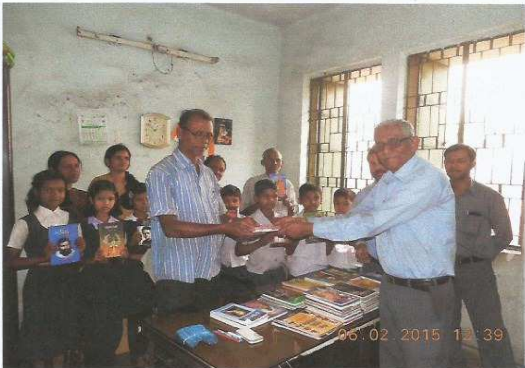
Headmaster, Central Colony Primary School, Central Colony receiving Library Books from Global Coal & Mining Pvt. Ltd.