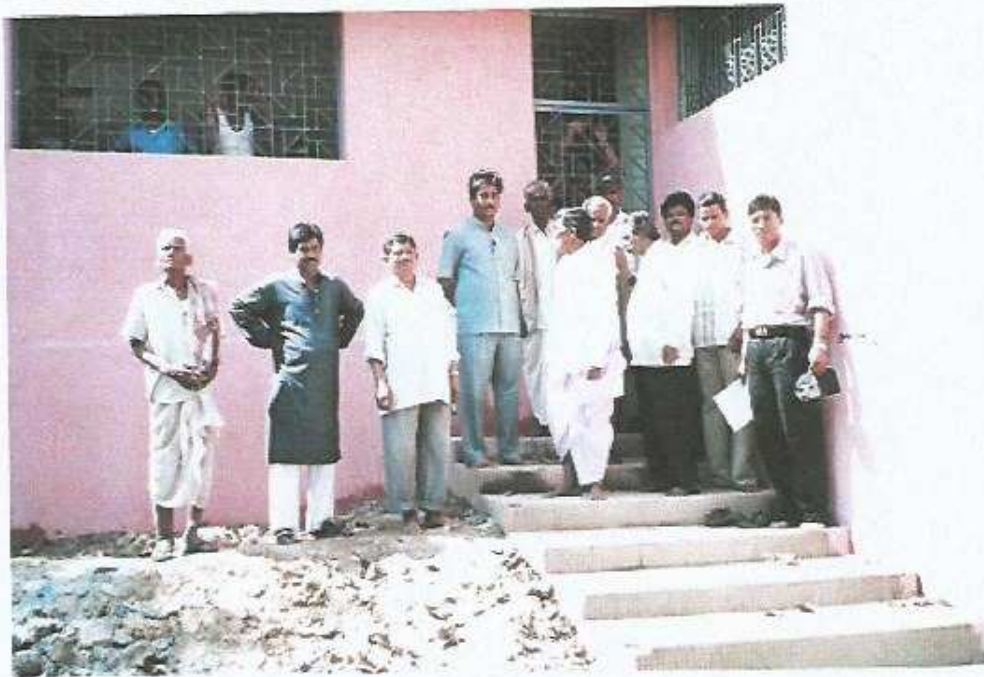
Kitchen Building in the Shivmandir of Village-Ghanatapada constructed by M/s Global Coal & Mining Pvt. Ltd., Talcher