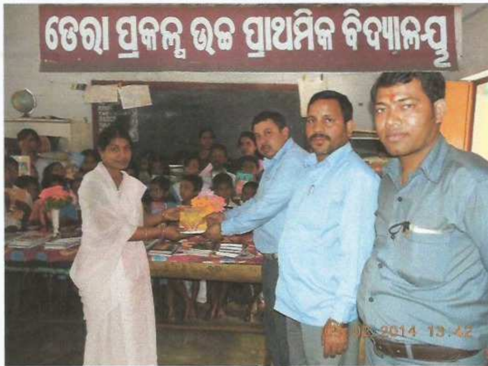
Headmistress, Dera Project U.P. School, Talcher receiving Library Books from M/s Global Coal & Mining Pvt. Ltd., Talcher