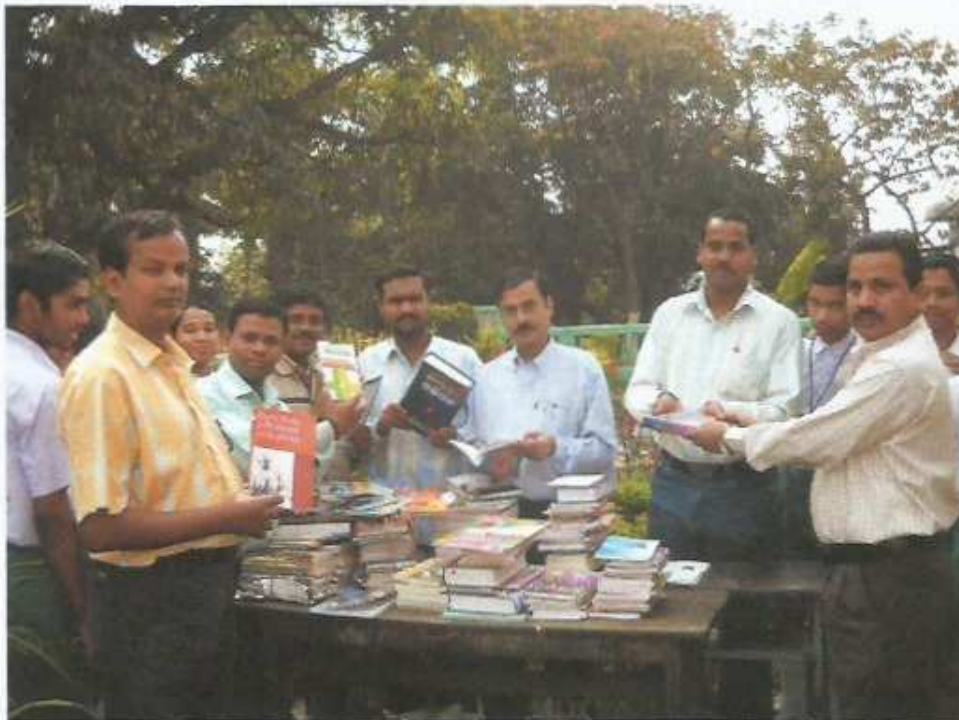
Principal, Aurobindo Integral Education and Research Centre Matrubhumi, Dera, Talcher receiving Library Books from Global Coal & Mining Pvt. Ltd.