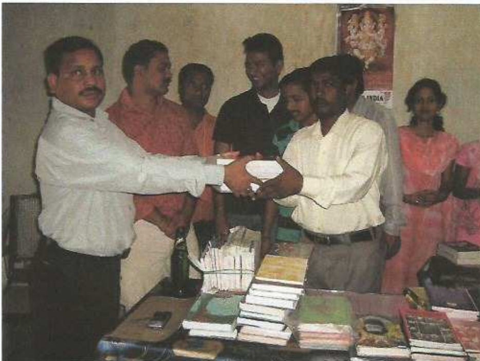
Headmaster, Panchayat High School, Tentulei, Talcher receiving Library Books from M/s Global Coal & Mining Pvt. Ltd., Talcher