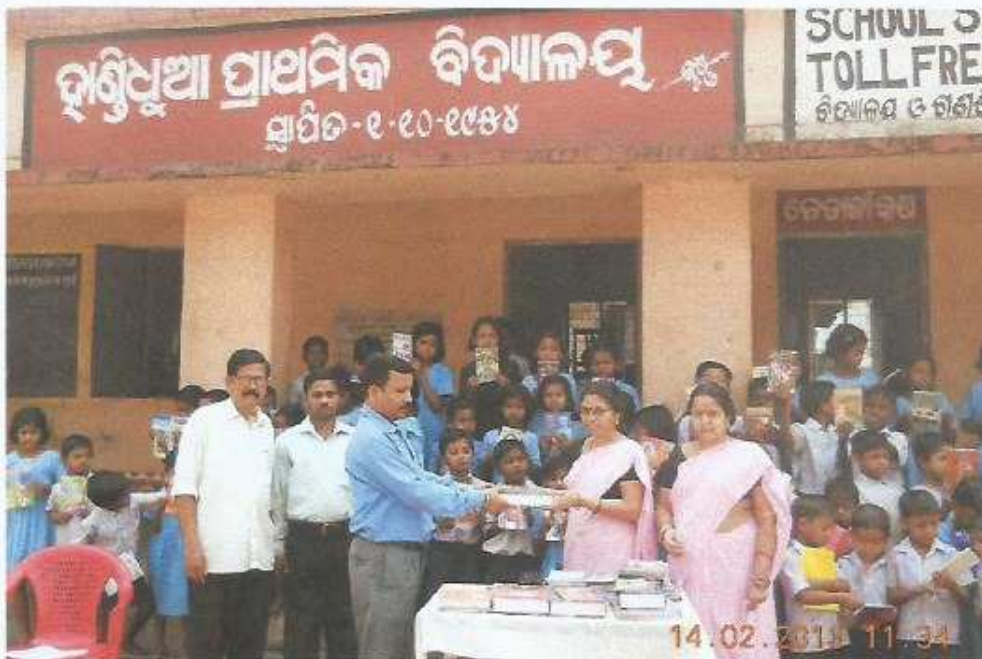
Headmistress, Handidhua Primary School, Talcher receiving Library Books from M/s Global Coal & Mining Pvt. Ltd., Talcher