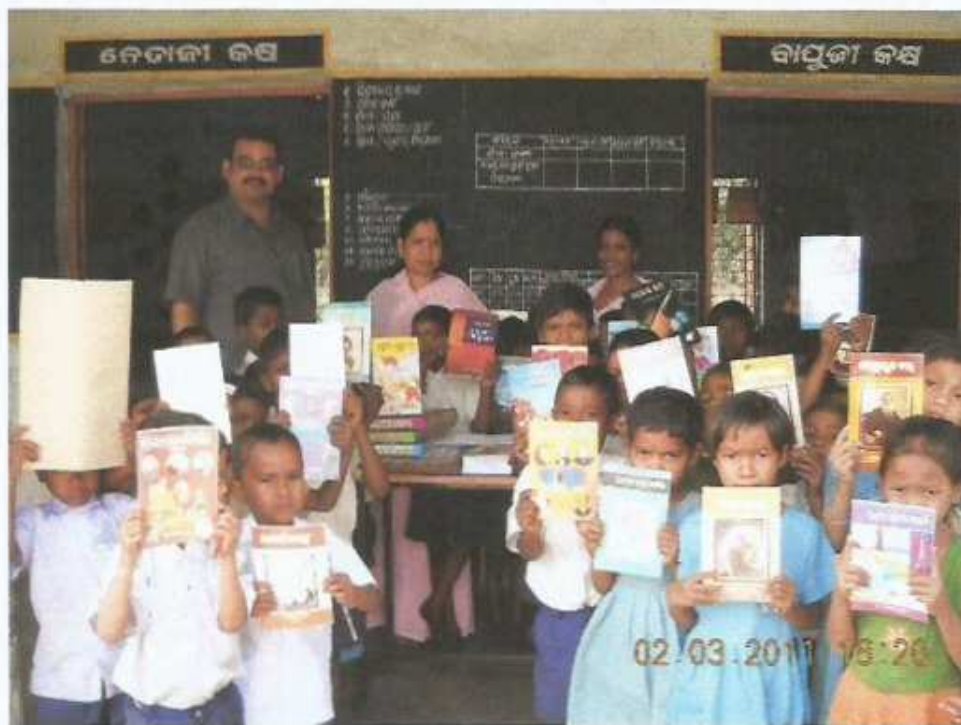
Teachers of Chatia Hatting Project Primary School, Chatia Hatting (Central Colony), Talcher receiving Library Books from M/s Global Coal & Mining Pvt. Ltd., Talcher