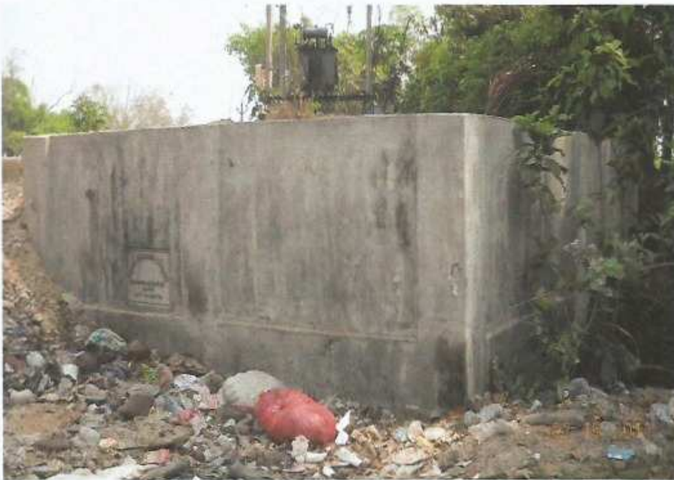
Public Dustbin constructed by M/s Global Coal & Mining Pvt. Ltd., Talcher in village Ghantapada