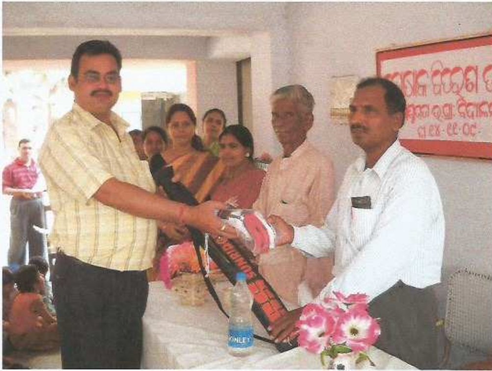
Headmaster, Ghantapada High School, Ghantapada, Talcher receiving sports equipments from M/s Global Coal & Mining Pvt. Ltd., Talcher