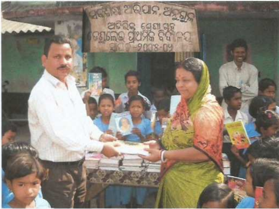
Headmistress, Tentulei Pry. School, Talcher receiving Library Books from M/s Global Coal & Mining Pvt. Ltd., Talcher