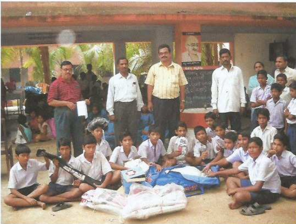
Sports equipments donated to Ghantapada High School, Ghantapada, Talcher by M/s Global Coal & Mining Pvt. Ltd., Talcher