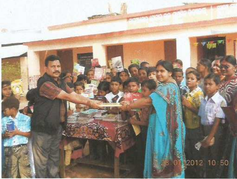
Headmistress, Baghuaboli Nodal U.P. School, Talcher receiving Library Books from M/s Global Coal & Mining Pvt. Ltd., Talcher