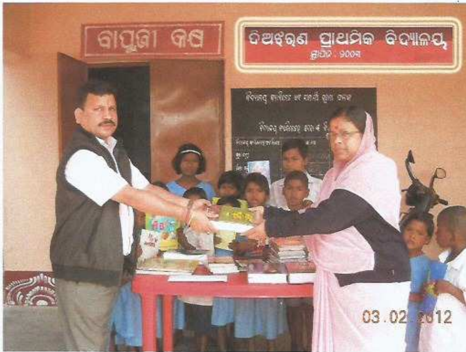
Headmistress, Deojharan Primary School, Talcher receiving Library Books from M/s Global Coal & Mining Pvt. Ltd., Talcher