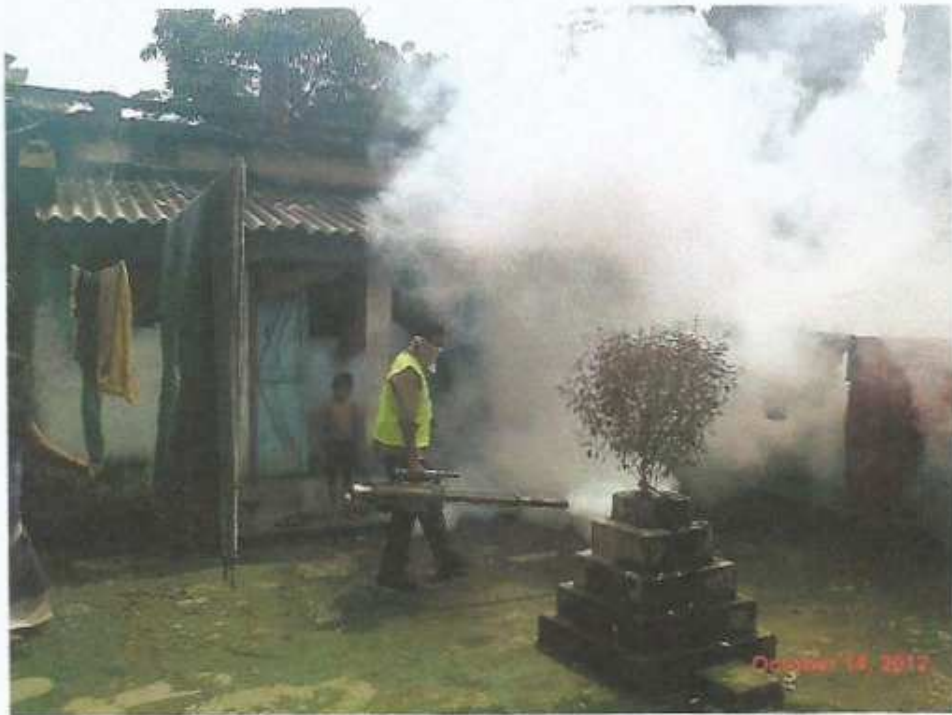
Fogging for mosquito prevention in the nearby villages