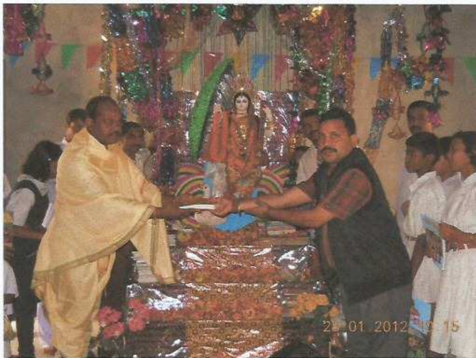
Pradhan Acharya, Saraswati Shishu Mandir, Deulbera Colliery, Talcher receiving Library Books from M/s Global Coal & Mining Pvt. Ltd., Talcher