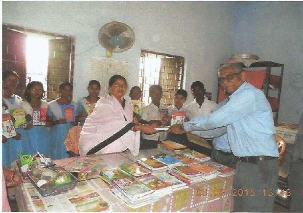
Head Master, P.C. Model U.P School, Talcher Town receiving Library Books from Global Coal & Mining Pvt. Ltd.