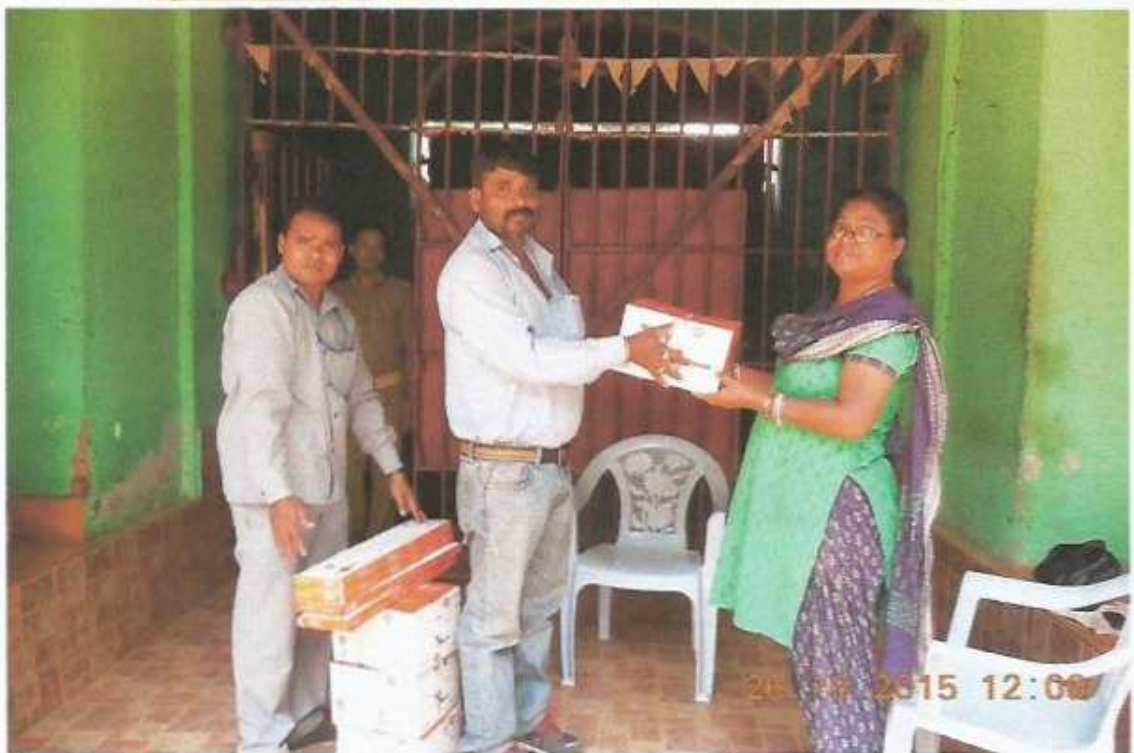
Superintendent, Sub-Jail, Pallahara receiving Ceiling Fan from Global Coal & Mining Pvt. Ltd., Talcher