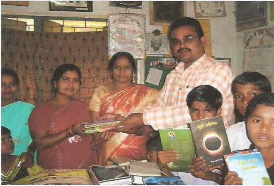
Headmistress, U.P School, Ghantapada, Talcher receiving Library Books from M/s Global Coal & Mining Pvt. Ltd., Talcher