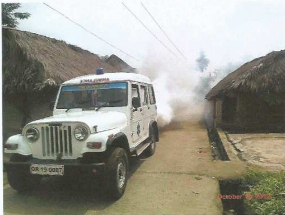
Fogging for mosquito prevention in the nearby villages