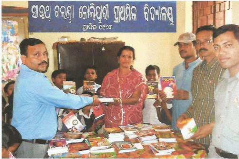
Headmistress, South Balanda Colliery Primary School, Talcher receiving Library Books from M/s Global Coal & Mining Pvt. Ltd., Talcher