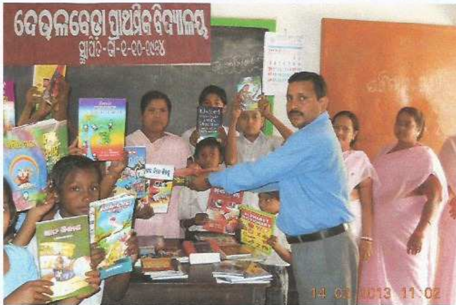
Headmistress, Deulabera Primary School, Talcher receiving Library Books from M/s Global Coal & Mining Pvt. Ltd., Talcher