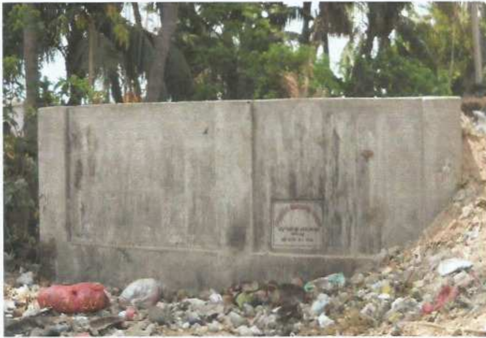
Public Dustbin constructed by M/s Global Coal & Mining Pvt. Ltd., Talcher in village Ghantapada