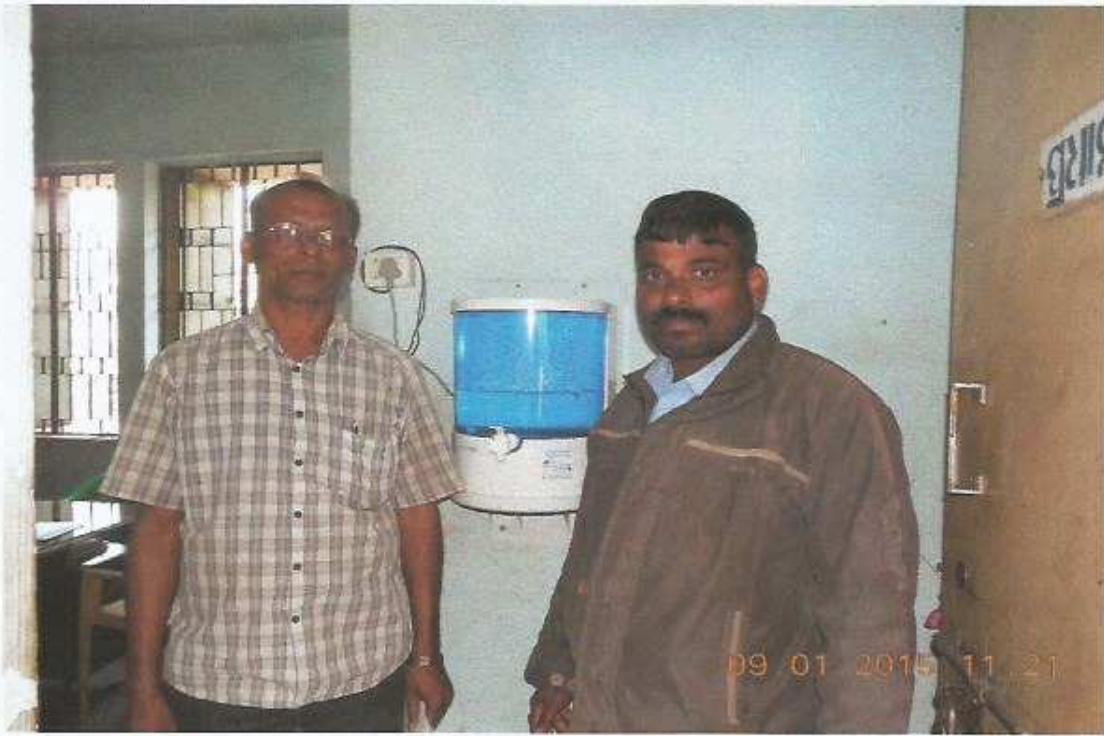
Aquaguard fitted in the school of Central Colony Primary School, Central Colony, Talcher by Global Coal & Mining Pvt. Ltd.