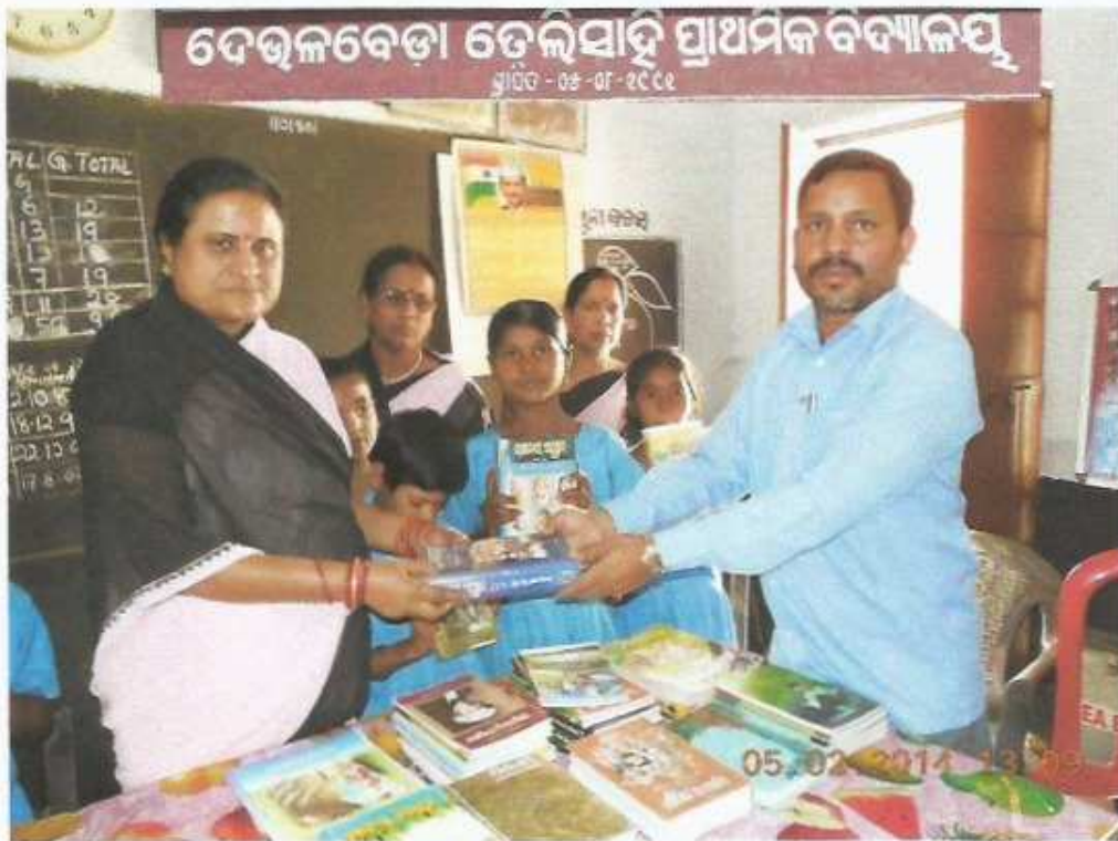
Headmistress, Deulabeda Telisahi Pry. School, Talcher receiving Library Books from M/s Global Coal & Mining Pvt. Ltd., Talcher