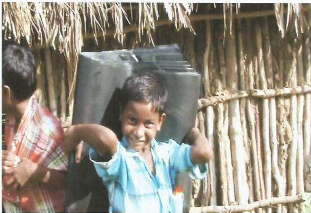
A boy of Bahali Village under Athmallik Tahasil of Angul Distict is extremely happy after getting Relief materials by M/s Global Coal & Mining Pvt. Ltd., Talcher