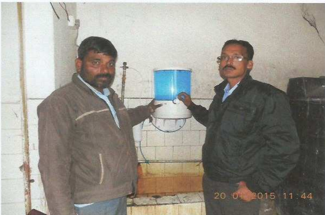
Aquaguard fitted in the school of South Balanda Colliery Primary School, South Balanda, Talcher by Global Coal & Mining Pvt. Ltd.