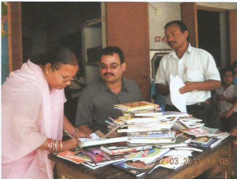
Teachers of Challagarh Primary School, Challagarh, Talcher receiving Library Books from M/s Global Coal & Mining Pvt. Ltd., Talcher