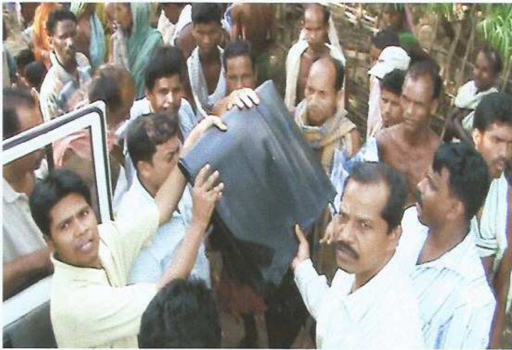
Relief materials being distributed amongst the villagers of Bahali under Athmallik Tahasil of Angul Distict by M/s Global Coal & Mining Pvt. Ltd., Talcher