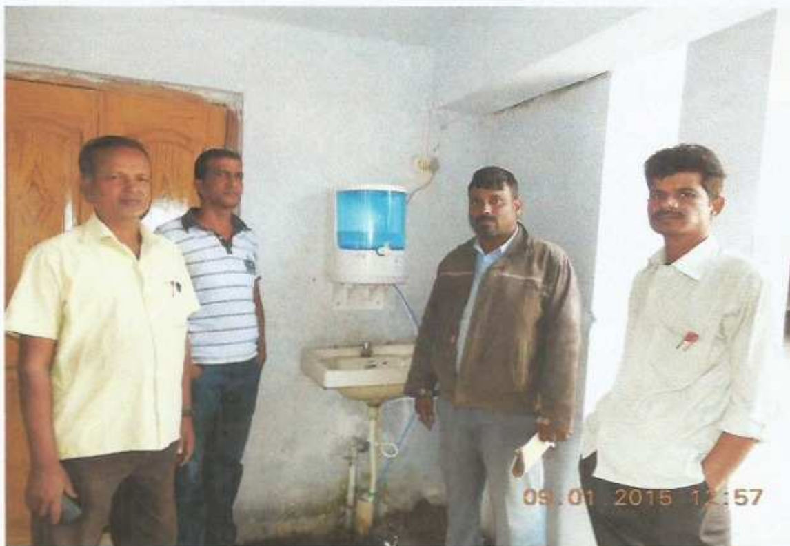
Aquaguard fitted in the school of Sri Aurobindo Integral Education & Research Centre, Matrubhumi, Dera, Talcher by Global Coal & Mining Pvt. Ltd.