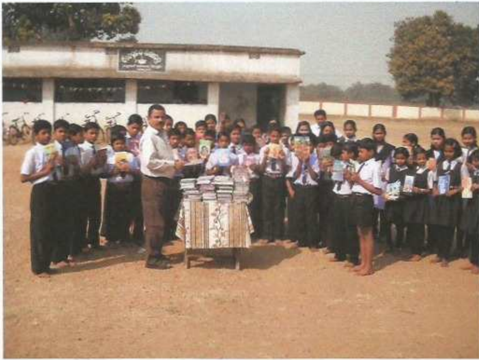
Library Books given to Vivekananda Sikshya Kendra, Ghantapada, Talcher by M/s Global Coal & Mining Pvt. Ltd., Talcher